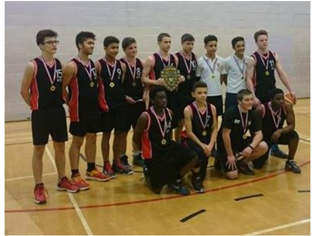
Reported by Ibukunoluwa Odumade